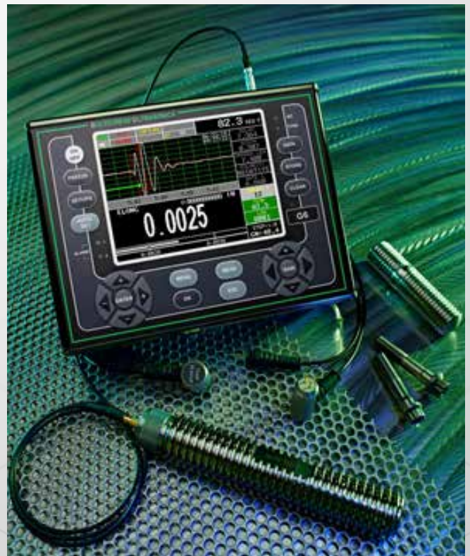
Image: The Boltstress G6. The G6 uses ultrasonic technology to measure the exact torque applied to each mill liner bolt during the relining process.

The relaxation on liners is particularly high. The mating surfaces between the liners and bolts are rough due to being cast and forged during manufacturing. Added to this, the tapered engagement multiplies any relaxation. Any small embedment of raised surfaces will be multiplied by the slope angle. For example if 0.1 mm embedment occurs on a 1:4 taper, the result is 0.4 mm in lost elongation.